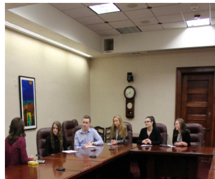
Inside the interview at the state capitol.

"We need to bring another industry to the state. Agriculture will always be the number one industry. We need to keep growing and trying to diversify to keep and attract young people to the state. Cybersecurity, other tech companies, and other innovative industries are some that we may look to attract." We thank Governor Noem for taking the time to sit down and talk with us! All Governor Newspaper staff members greatly appreciate it!