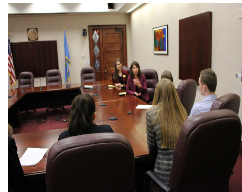
Governor Noem gives answers to questions.